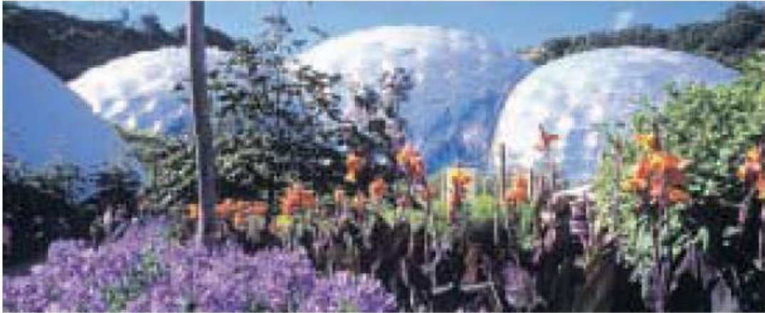
GARDEN OF EDEN . . . the Project recreates rainforest and Mediterranean climates

GETTING THERE: Air Southwest operates regular flights to Newquay Airport from Glasgow, Leeds Bradford, Manchester, Dublin, Cork and Bristol. Flights from Glasgow to Newquay Cornwall start from £79 each way. Book at airsouthwest.com STAYING THERE: Stay at The Cornwall Hotel Spa & Estate in a two-bedroom woodland home from £100 per night. Call 01726 87 40 50 or visit thecornwall.com MORE INFO: For car hire, visit croftlea-carhire.co.uk or call 01637 874449. Prices start from £19.95 per day.